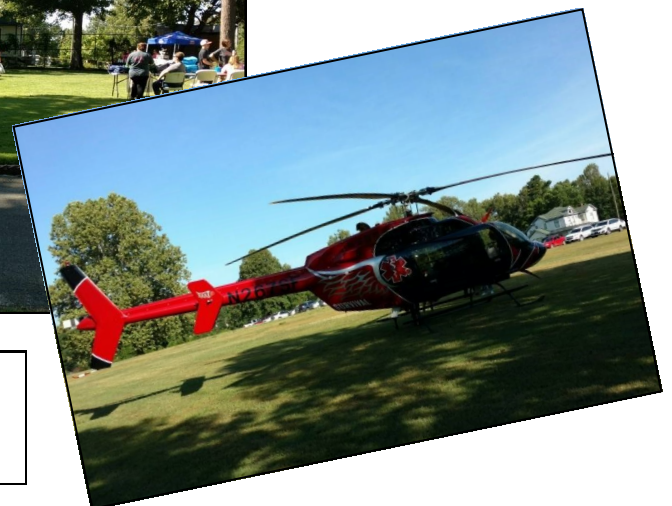
Some photos of the Piggott Backpack Bash.