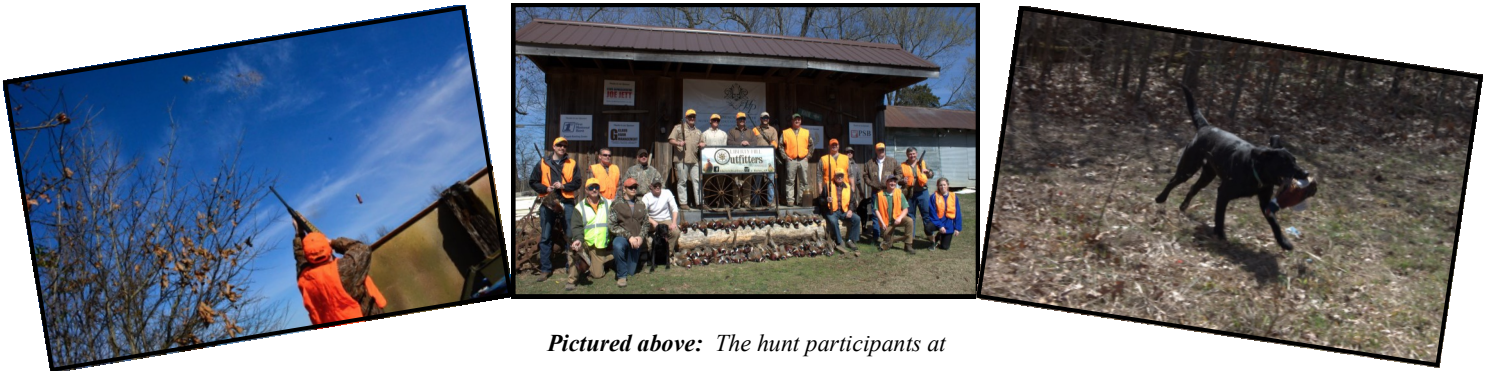
Pictured above: The hunt participants at Liberty Hill Outfitters.

Next year's hunt will be held on February 17, 2018. For information on joining us—or being a sponsor—please contact the museum.