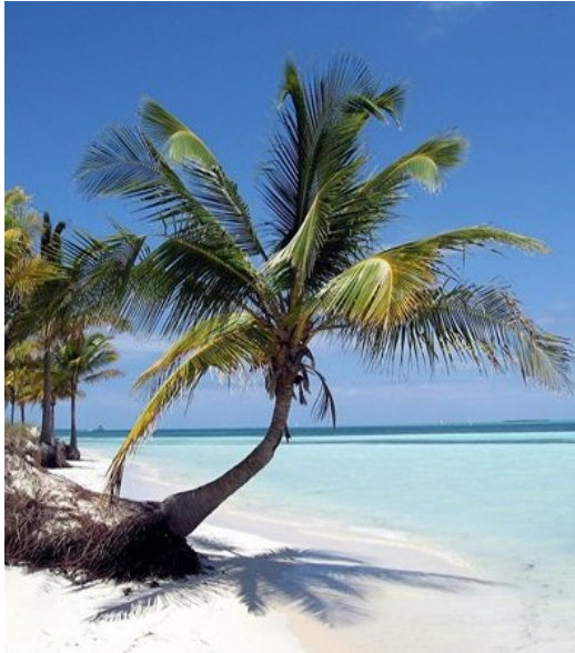
Cayo Guillermo, Cuba—one of the settings for Islands in the Stream