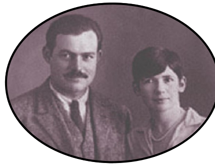
Ernest and Pauline Hemingway's Paris Wedding May 10, 1927

Shop and Dine "On the Square." The downtown area is lined with shops featuring antiques, collectibles, and unique gifts, along with dining facilities.