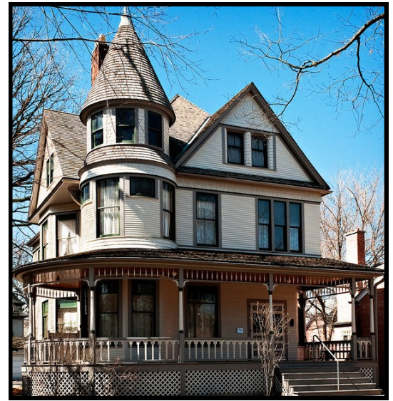
Pictured above—The Hemingway Birth Home, Oak Park, Illinois