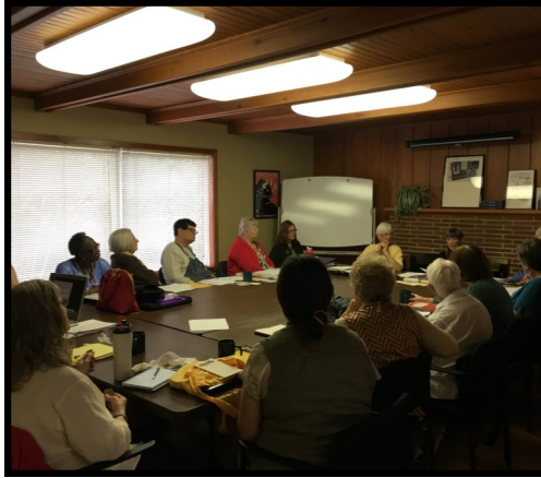
The writers at the Fall Writers' Retreat, November 2015