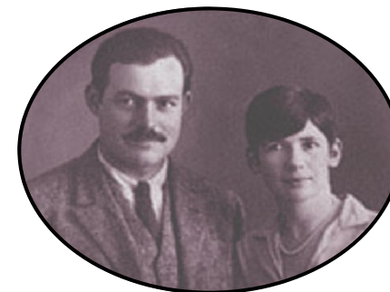
Ernest and Pauline Hemingway's Paris Wedding May 10, 1927

Shop and Dine "On the Square." The downtown area is lined with shops featuring antiques, collectibles, and unique gifts, along with dining facilities.